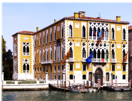
Venice (I), Palazzo Franchetti, 17-22 January, 2021